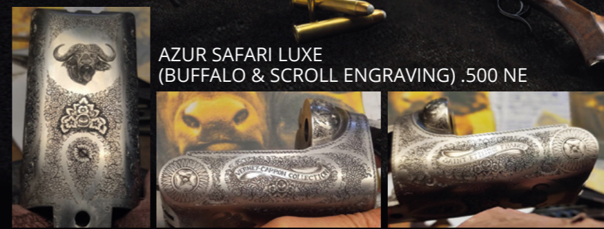
AZUR SAFARI LUXE (BUFFALO & SCROLL ENGRAVING) .500 NE