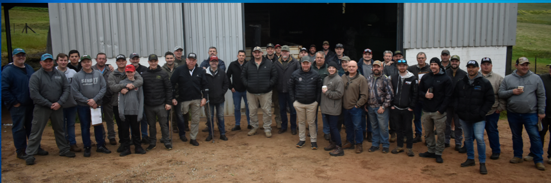
📍 Send IT ELR group - 30th September 2023