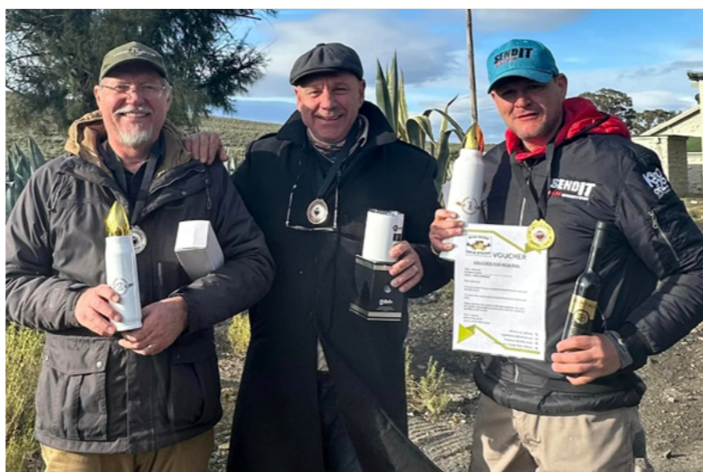
1 Send IT ELR Winners – 2-mile Challenge 30th July 2023