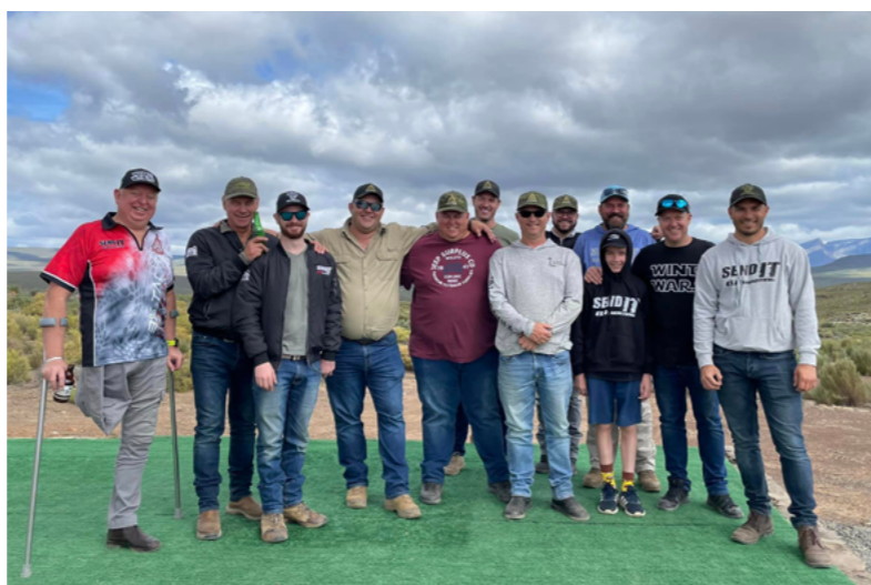
1 Send IT 2-Mile Challenge 18 March 2023